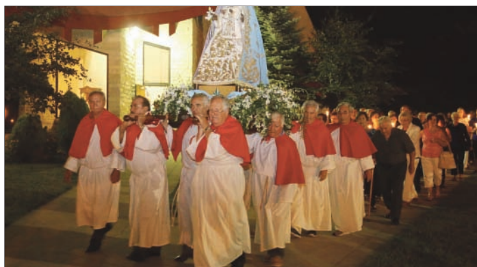
Evening procession around chapel