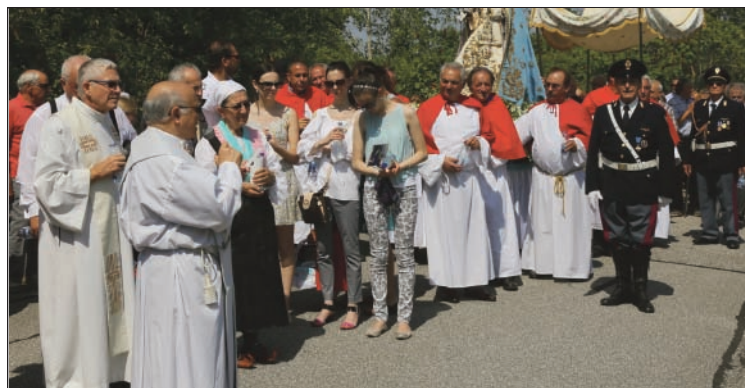
Prayer on hilltop