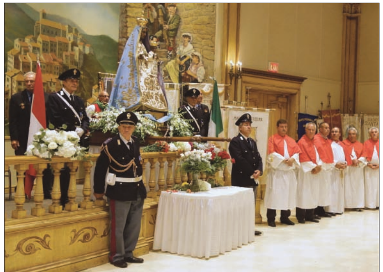
Polizia Stradale protecting the Madonna