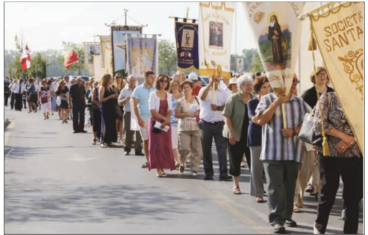
Procession to the hall