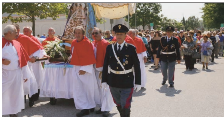
Walking around the track