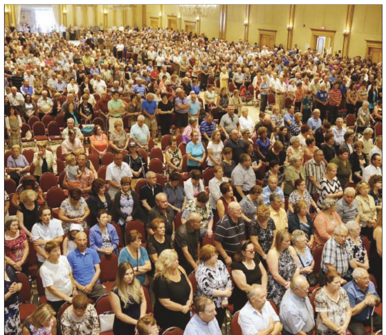
The crowd at the mass