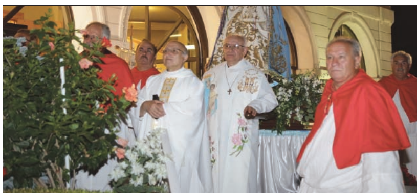
Enjoying the fireworks