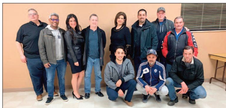
2020 SOCCER GROUP