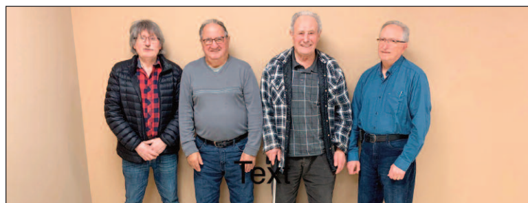
2020 MEN'S BOCCÉ GROUP