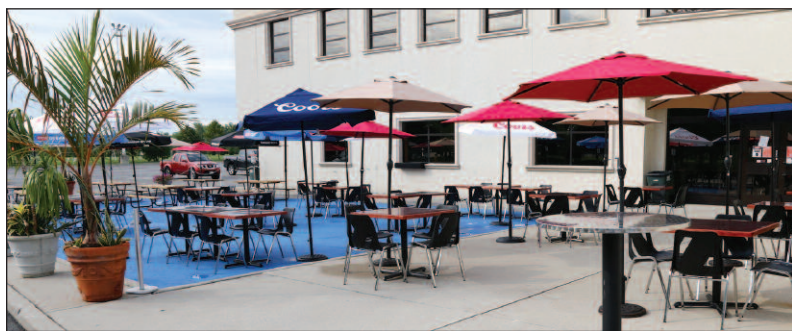
OUR NEW OPEN PATIO