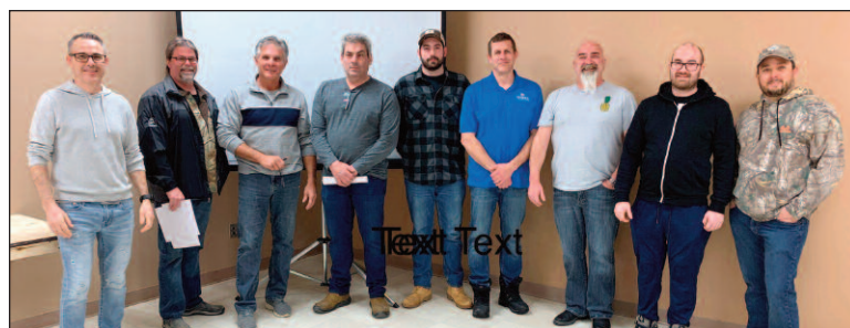
2020 SPORTSMEN GROUP