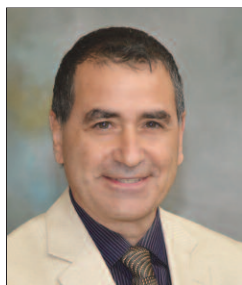
Carissimi Ciociaro Club Members.

In this world of wonder, there is not much to