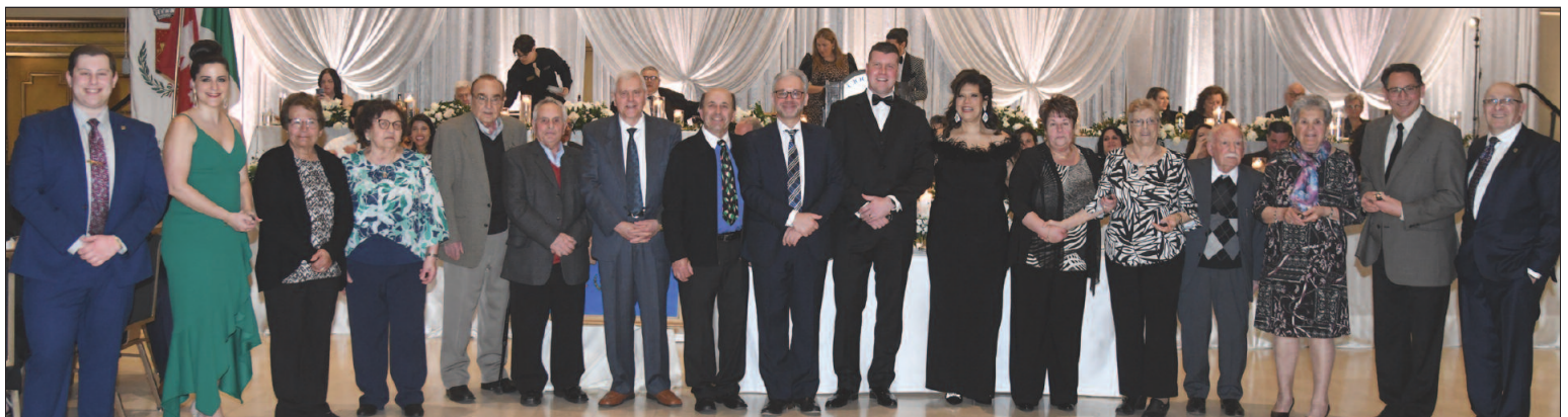
25 YEAR PIN RECIPIENTS