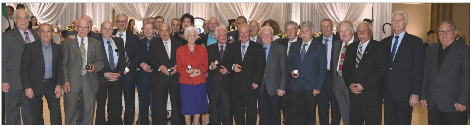
50 YEAR PIN RECIPIENTS