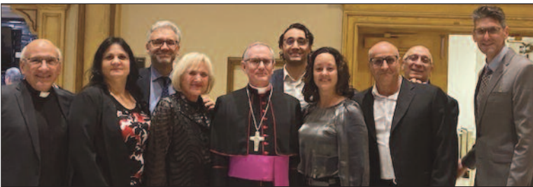
The Bishop's Dinner was well attended and we were happy to support with a few of our board members attending.