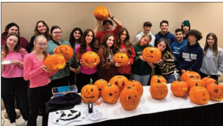
Some of our youths carving pumpkins