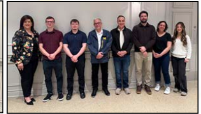
The following new members were sworn in April, 2026.