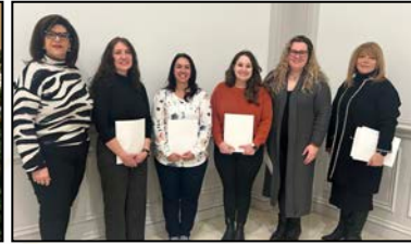
The following new members were sworn in February, 2026.