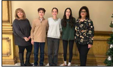
The following new members were sworn in December, 2025.