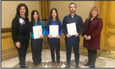
The following new members were sworn in November, 2025.